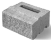
XL UNIT 12 x 16 x 6" 300 x 400 x 150 mm