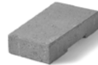
WEDGE CAP UNIT 8½ (7¼) x 12¾ x 3" 215 x (187) x 323 x 75mm