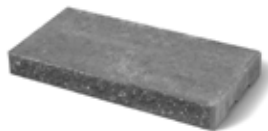
COPING/STEP TREAD 12 x 24 x 3" 300 x 600 x 150mm