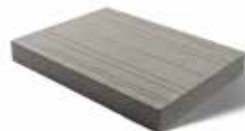
UNIVERSAL BASE UNIT 14 x 19 x 2" 355 x 482 x 55mm