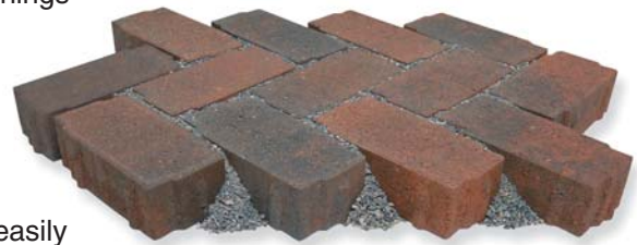
4" x 8" x 2 3/8"